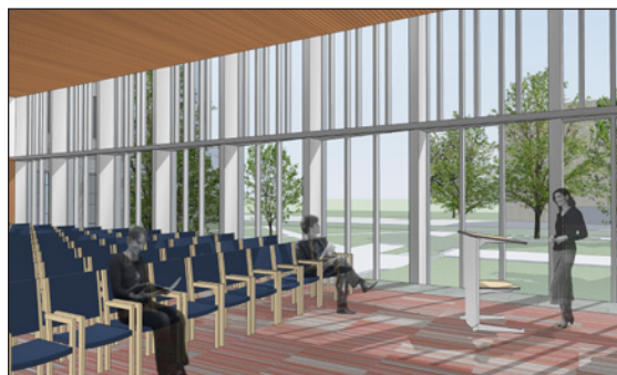
New space for public conversations on religion with leaders like Jimmy Carter, Toni Morrison, the Dalai Lama, and scholars throughout academia.