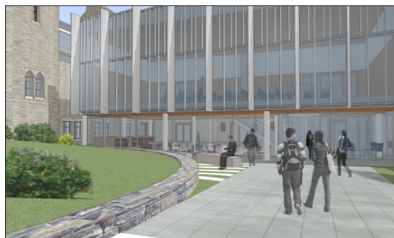
Creation of a true campus center that brings Andover Library and the School's core academic resources together with student services and social space.

Our students deserve a modern, dynamic space for learning. Future students will expect it. As HDS looks to its third century, we aim to ensure that this vital and distinctive building lives up to its potential as the center of the School's effort to empower scholars and leaders for a religiously complex world.