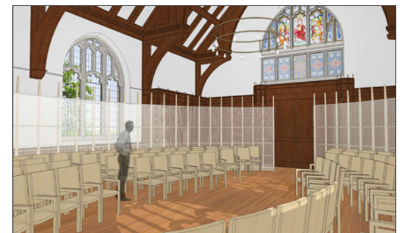
A multifaith chapel where Christians, Jews, Muslims, Buddhists, Hindus, and all members of HDS community may gather to worship, perform, and share experiences.